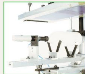
- Air inflation unit