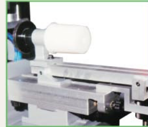
- Round print attachment