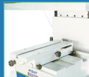
- Work table