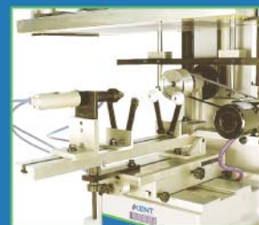
- Registration unit