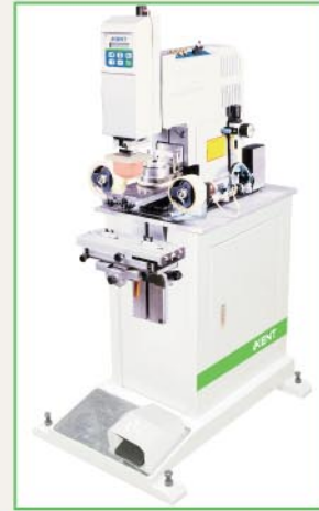
- Stand alone with pad cleaning