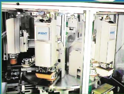
- 6 or 8 Aliens on an indexing table